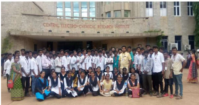
Industrial Visit to CSIR - CECRI, Karaikudi observes Open Day Celebration on 26.09.19

The students along with the staff members visited the outside campus Central Electro-Chemical Research Institute (CECRI) in open day. The visit was highly focused on Research Instrumental activities and working processes of Technical instruments.